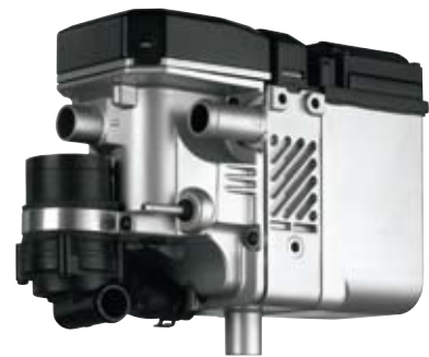
Webasto Thermo Top C Motorcaravan