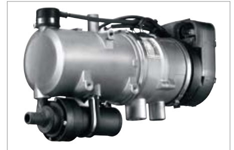
Thermo 90 ST