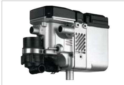
Thermo Top C Motorcaravan

The circuit of the heater can be connected with the hot water boiler of the vehicle